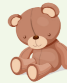
One thing 1個