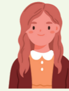
One person 1人