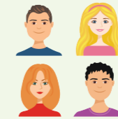
Two or more people 2人以上